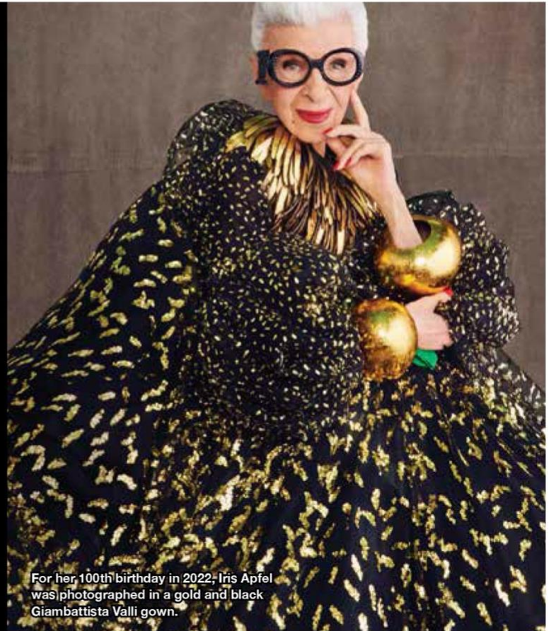
For her 100th birthday in 2022, Iris Apfel was photographed in a gold and black Giambattista Valli gown.

She came to fame in the fashion world in her 80s and 90s, and her wildly eclectic closet of clothes formed a hit exhibition at the Metropolitan Museum of Art.