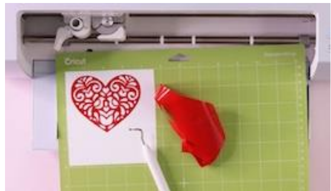
Cutting vinyl with Cricut