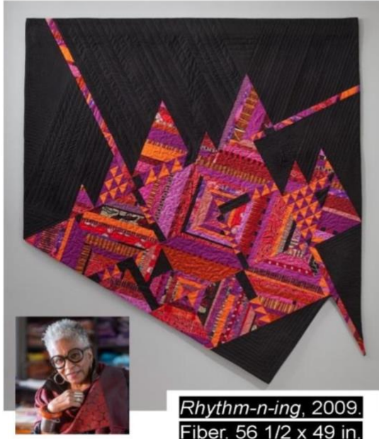
Rhythm-n-ing , 2009. Fiber. 56 1/2 x 49 in.