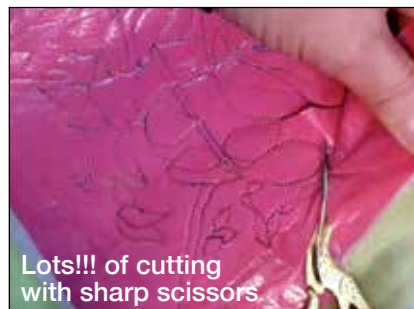
Lots!!! of cutting with sharp scissors