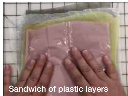
Sandwich of plastic layers